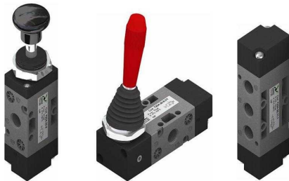
Lever Lateral Spring Valves