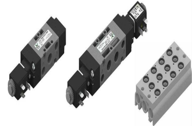
Manifolds & Valves

For further information please call & speak to our Pneumatics department on 0151 546 6689 or alternatively visit our website to find out more about Pneumax and all the other Products & Services that we can offer :