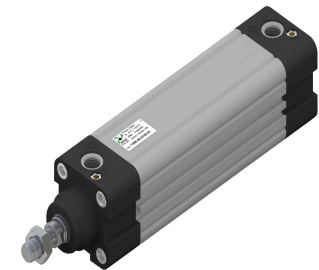
ISO Standard Cylinders