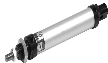
Microcylinders ISO Standard

Precision Pneumatics Ltd Villiers Court Knowsley Business Park Liverpool L34 9ET T: 0151 546 6689 Fax: 0151546 6808 E-mail: sales@precisionpneumatics.co.uk Web: www.precisionpneumatics.co.uk